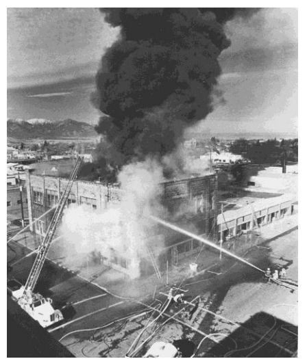
The Rand Building burned in 1985. Today the corner is the site of the Banner Bank parking lot.