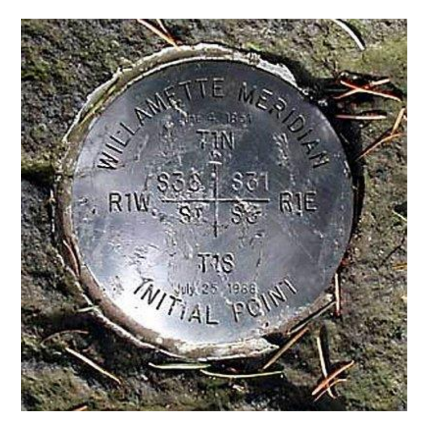
Oregon-Washington starting point of PLSS is in west Portland

The basic PLSS units are six-mile-square "townships." Each township is divided into 36 one-mile-square "sections." The Government Land Office contracted with surveyors to survey every one of the 36 sections of a township. A property's legal description was, and still is, in relation to where the property is located within a given township. In 1864 the Oregon Surveyor General's office was in Eugene City, Oregon, with a satellite office in La Grande.