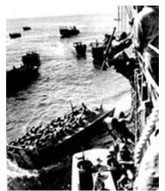
Descending USS Clymer to the landing craft at Bougainville.

At the end of October 1943, the battalion sailed from Espiritu Santo harbor to Guadalcanal and on to Bougainville. On Sunday, October 31, the shipboard activities of the troops had changed. There were hardly any pinochle or small-stake poker games and there was a great deal more cleaning of weapons; even the bullets were cleaned and oiled.