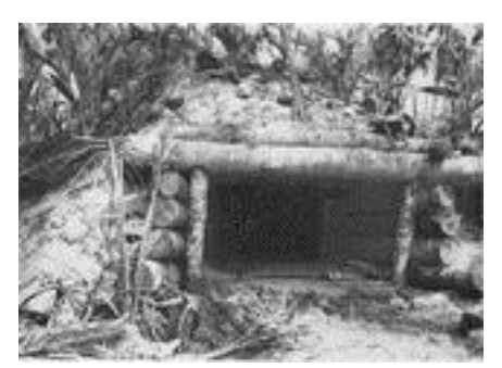
Japanese machine gun bunker on Bougainville.

Since F and G companies had landed 300 yards north of their designated landing site, they head out single file down the beach and turn inland to find and hold their next objective, a clearing with a trail running through it. "We can hear concentrated firing from the direction of the trail," wrote Azine. "F and G are there already. A runner from one of the leading companies comes back. He reports that F and G have reached the opening of the trail, advanced inward a short distance, and are now in contact with the Japs. They are being held up by stubborn mortar and machine gun resistance....This particular skirmish along the trail leading from Empress Augusta Bay into the Bougainville jungle lasts about three hours. When it is over the Raiders have driven the Japs back into the hinterland and secured our section of the beachhead."