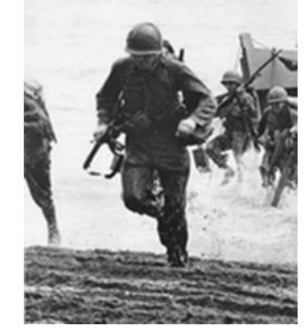
Marines storming the beach at Bougainville.

At the end of October 1943, the battalion sailed from Espiritu Santo harbor to Guadalcanal and on to Bougainville. On Sunday, October 31, the shipboard activities of the troops had changed. There were hardly any pinochle or small-stake poker games and there was a great deal more cleaning of weapons; even the bullets were cleaned and oiled.