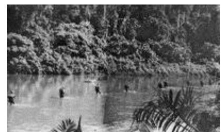
One of many river crossings on the Long Patrol.

"What a luxury after a month on the trail with a pack and a weapon as constant companions, day and night, every minute of a 24 hour day. The lean, gaunt, hollow-eyed Raiders had trekked over 120 miles through steaming hot jungles, burning sudans of open kunai grass, crossing dozens of rivers, streams and swamps intermingled with a series of battles with the enemy Japanese east of the (Henderson Field) perimeter. Daily tropical downpours were alternated with long periods of burning hot sun and no water. Short rations of tea and rice were supplemented with such foods as the natives could scrounge in the bush: papayas, limes, plantains or bananas, etc. Jungle diseases—fevers, fungus, dysentery, sores that refused to heal—literally decimated the ranks of the brave, determined Raiders who strove to fight one more day regardless of the pain and misery, rather than leave their buddies to go on without them."