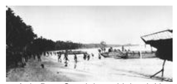
Landing at Aola Bay, Guadalcanal Island, Nov. 4, 1942.

In early November 1942, C and E companies of Carlson's 2<sup>nd</sup> Raider Battalion finally got their chance to enter the Guadalcanal fight, if only for a planned two-day mission to provide protection for Army engineers, while the engineers assessed an area of the island as a possible site for another airfield.