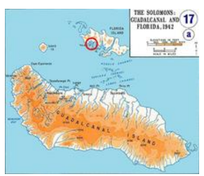
Tulagi Island (red circle) lies north across Iron Bottom Strait from Guadalcanal.

"I broke down and cried like a baby when it happened. So you see all marines are not as hard-hearted as some people think.