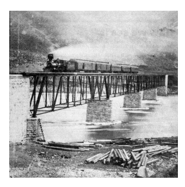
Train on First Trestle Over Snake River (1884). Located South of the Confluence of Snake and Burnt Rivers.

across Burnt River between Huntington and Durkee. The construction was dangerous. In June 1884 three men were killed by a cave-in in a tunnel. A couple of months later near Weatherby, a teamster hauling bridge timbers was killed when his load rolled on a steep incline. He tripped in fleeing and the timbers hit his head, "making it into jelly," reported the Reveille .