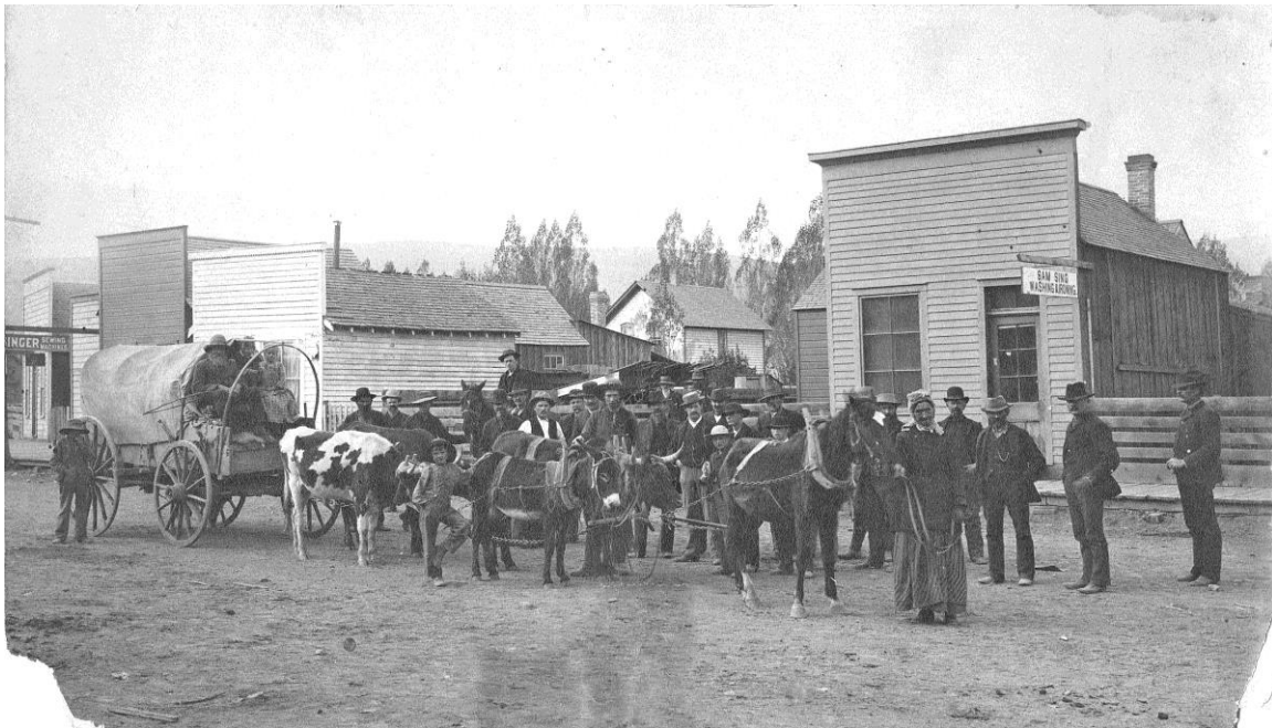
Covered wagon at SW corner of Main & Auburn, 1884.

When the trailers passed through Boise, Idaho, in October 1884, the Boise Democrat reported, "The wheelers were oxen, succeeded by the donkey mated also with an ox, which in turn was preceded by a horse led by a man. The oxen were no larger than the Burmese cow of traveling menageries. The jack was about the size of a Newfoundland dog. The horse was also diminutive and seemed to be a collection of equine bones articulated for the occasion." The article reported that the group was from Texas and headed for the Willamette Valley.