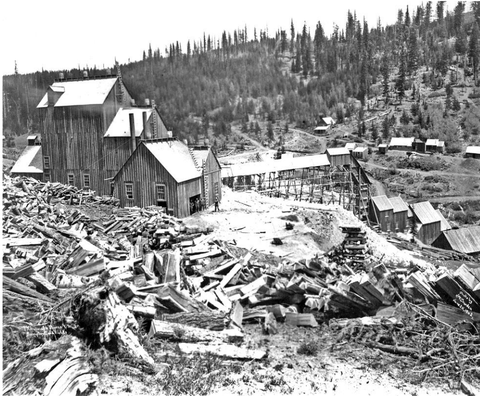
Mammoth Mine on June 24, 1902. First quartz mine claim in the Sumpter District, filed in 1869.

Hawley's albums also contain hundreds of annotated photographs of hard rock (quartz) mines in Baker and Grant counties. Those images document the millions of dollars invested in gold mining ventures, mainly during the decades immediately after the coming of the railroad in 1884, which facilitated transport of the heavy machinery necessary to pump out water-filled tunnels, lift ore from deep in the earth, and crush it in huge stamp mills. A photograph of the Mammoth Mine—located high in the Elkhorn Mountains six miles northwest of Sumpter and one of the earliest large-scale hard rock mining operations—illustrates the tremendous amount of necessary infrastructure. In the album margin, Hawley gives some history of the mine. “The Mammoth is the first quartz claim in the Sumpter district being staked out in 1866....[A] 5 stamp mill was built at the Mammoth in 1879....The trestle, center of picture, leading to [the] mill was still standing when I was there in 1960.”