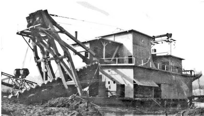
Sumpter Valley Dredge No. 1. It operated from 1913-1924.

The library's photograph collection contains thousands of fascinating images: 2,000 photographs of Baker City, mostly of six blocks of the Main Street business district; 1,000 photographs of Baker County's small towns and ghost towns; 1,100 photographs of about 120 different mines and gold dredges; and thousands of photographs in subject matter areas such as Sumpter Valley Railway, people, nature, organizations, schools, logging, farming, and ranching. A dedicated group of volunteers has worked with the collection for over thirty years.