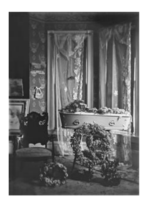
Casket of Ethel Denham, age 7 Denham Living Room, 1507 3rd Street

Perhaps the most poignant photograph in the Denham collection is the one of a child's flower-bedecked casket on a stand in the bay window area of the Denham home. Propped up on a chair to the left of the casket is the photo of two girls. It may be assumed that the older girl is May Denham and that the younger girl is Hugh Denham's fourth child, Ethel Ester Denham, who died May 2, 1900, at age seven. Another photo shows Denham's youngest child, Lloyd, at about age four standing at his sister's grave located in the east end of the protestant portion of Mt. Hope Cemetery.