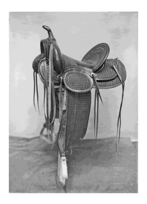
Hugh Denham Saddle

The richness of the Denham photo collection is in the variety of Baker City subjects which Denham captured with his camera in the years just before WWI. There are series of photos of Denham's house and neighborhood, his saddles and harnesses, camping, including car camping, ice skating on Powder River, Baker City park, children playing, a train wreck, Mt. Hope Cemetery, farming, fishing, and an excursion boat on Wallowa Lake.