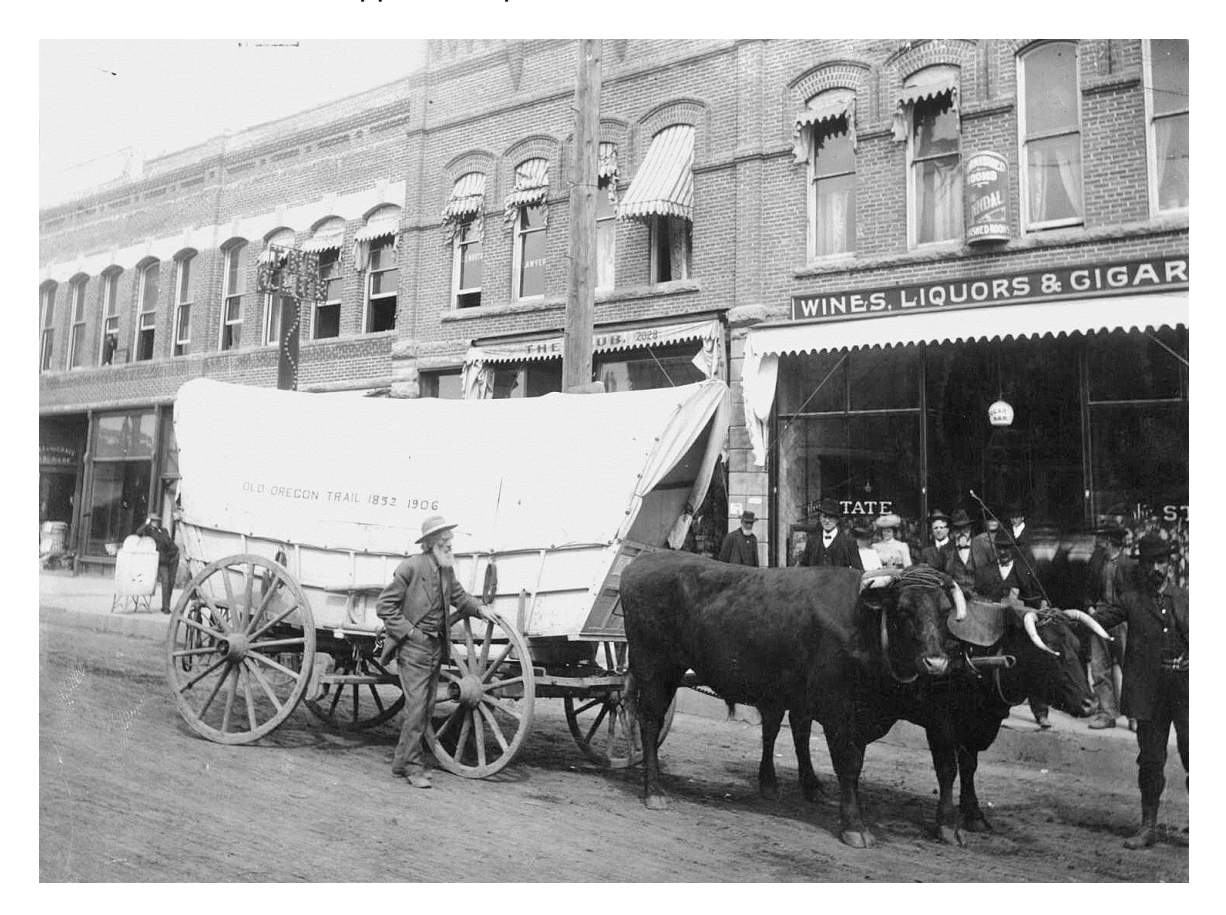
Ezra Meeker on Main St. with his oxen team and covered wagon in 1906. As a young man Meeker traveled to Oregon in 1852 in a wagon like this one.

small marker on the Oregon Trail where it intersected today's Highway 86 a little west of the turnoff to the National Oregon Trail Interpretive Center on Flagstaff Hill. "During the forenoon I drove out about six miles easterly on the road to lower Powder River to an intersection on the summit of a high ridge where the trail (coming from Virtue Flat) is still now crossing the road nearly at right angle. I found a deep worn section of the Trail at the intersection and planted an inscribed granite marker 30 inches long and 9 inches square and hauled two loads of boulders to support and protect it."