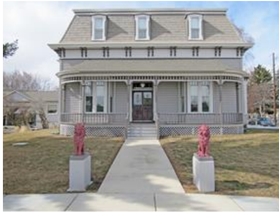
Heilner House on SW Corner of 2 nd & Court streets