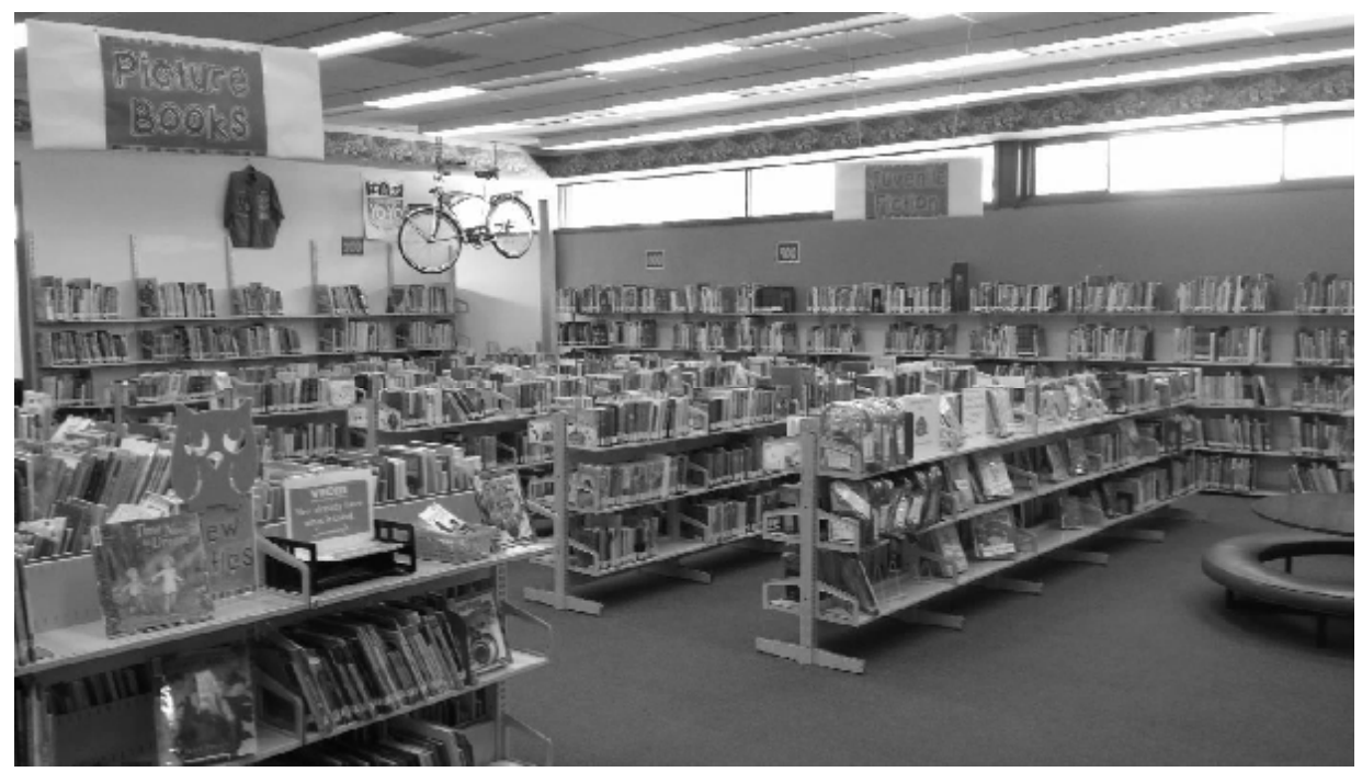
7 The children's book collection has been weeded and updated. The Storyroom has a large new monitor for programs.

The Baker County Public Library offers a variety of materials and atmosphere for young visitors