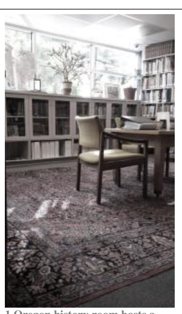
1 Oregon history room hosts a recently restored Persian rug