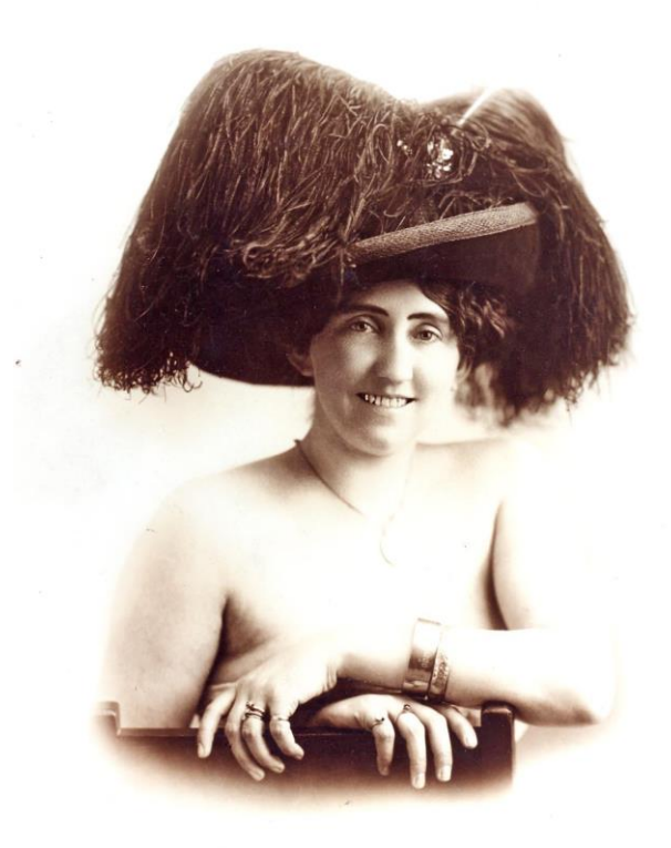
Baker City Prostitute, ca. 1906

The white city fathers purposely turned a blind eye to goings on, including opium dens, in Chinatown, apparently not concerned about the internal moral affairs of the Chinese. However, in September 1906, city council considered ordering erection of a tall fence to wall off the Nile District "to make it less offensive to the people passing on the several thoroughfares bordering that district." Access to Chinatown would be through a gate in the fence at the corner of Resort and Auburn.