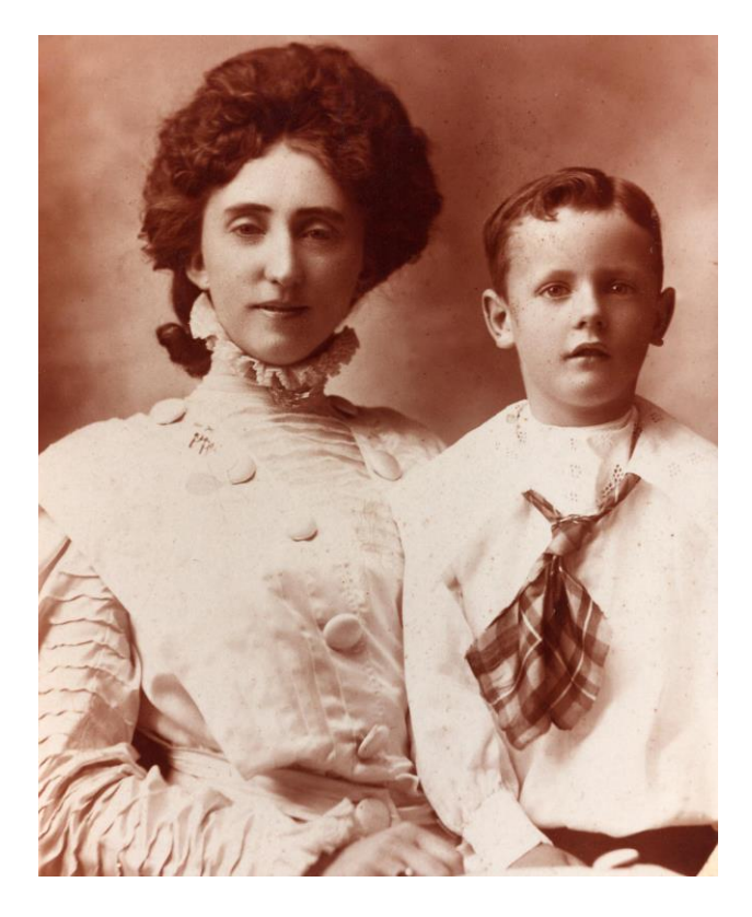
Baker City Prostitute and Son, ca. 1906

A day later the Morning Democrat complained about "the brazenness of the women of the bawdy houses in parading the streets during daylight and darkness in company with men who are forgetful of public decencies." And on December 30, the newspaper criticized city officials for allowing a sign on "the most conspicuous bawdy house" in town, Fanny Hall's mansion, that read "Furnished Rooms to Let," as if it were a regular boarding house.