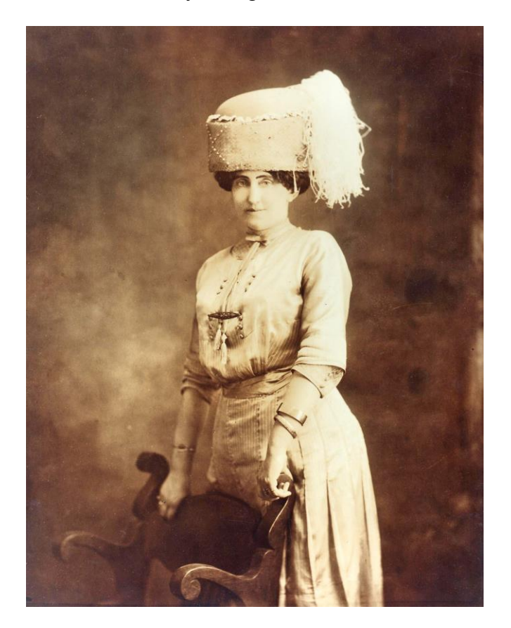
Baker City Madame, ca. 1906