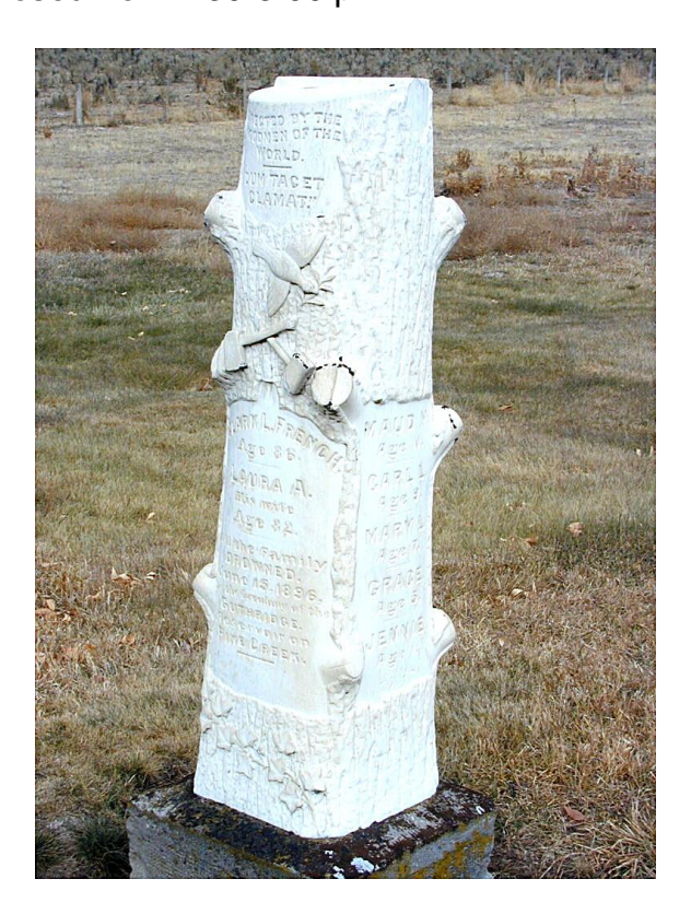
French Family Grave Marker Mt. Hope Cemetery in Baker City