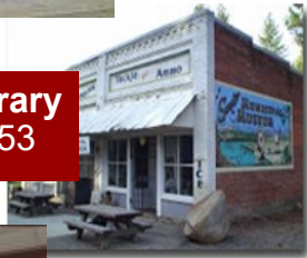
Sumpter Library 541-894-2253