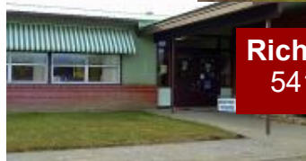
Richland Library 541-893-6088