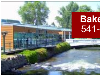
Baker Library 541-523-6419