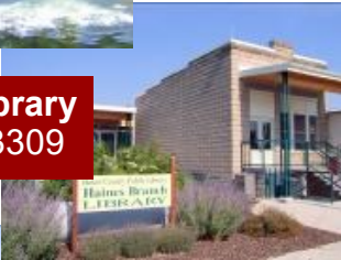
Haines Library 541-856-3309