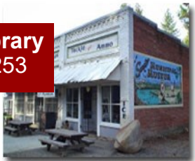
Sumpter Library 541-894-2253