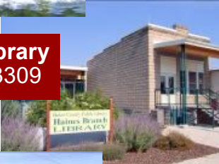
Haines Library 541-856-3309