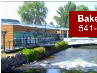
Baker Library 541-523-6419